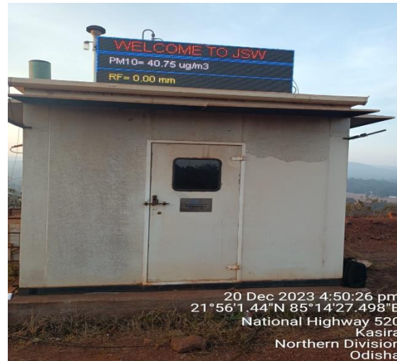
Continuous Ambient Air Quality Monitoring Stations