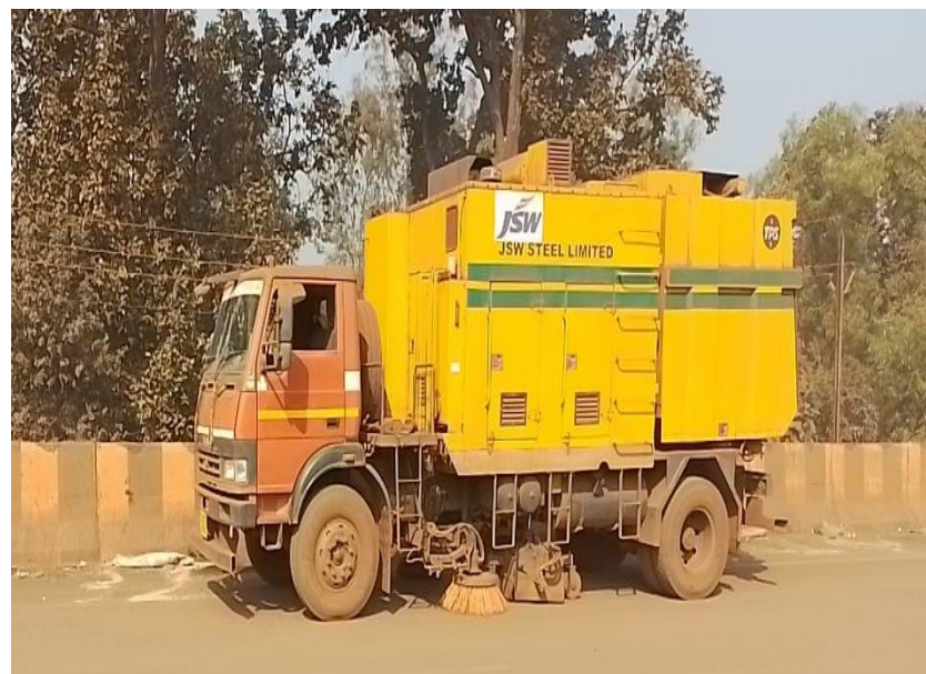
Road Sweeping Machine