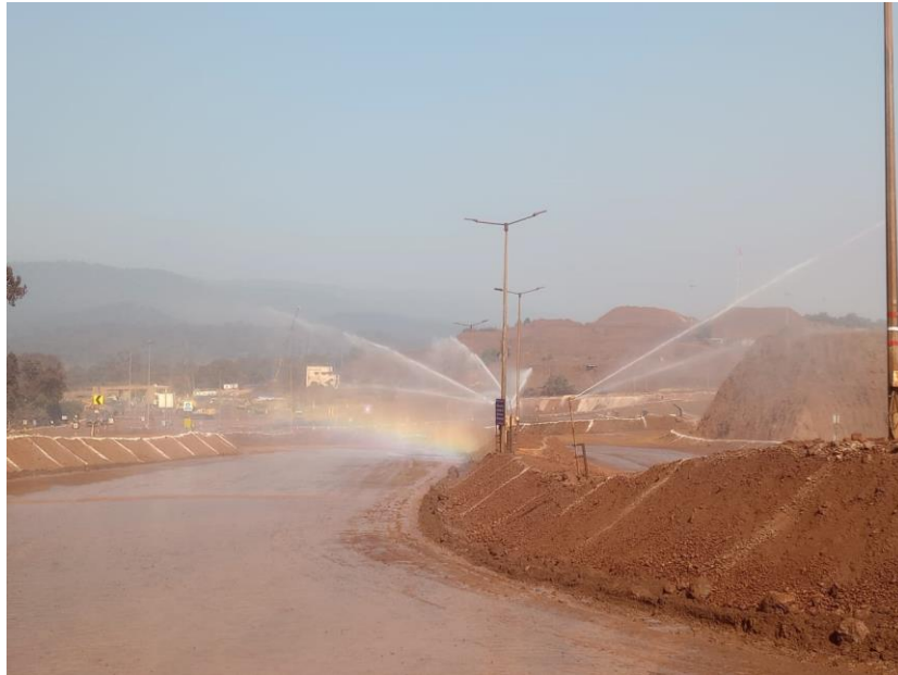
Existing Fixed Sprinkling System