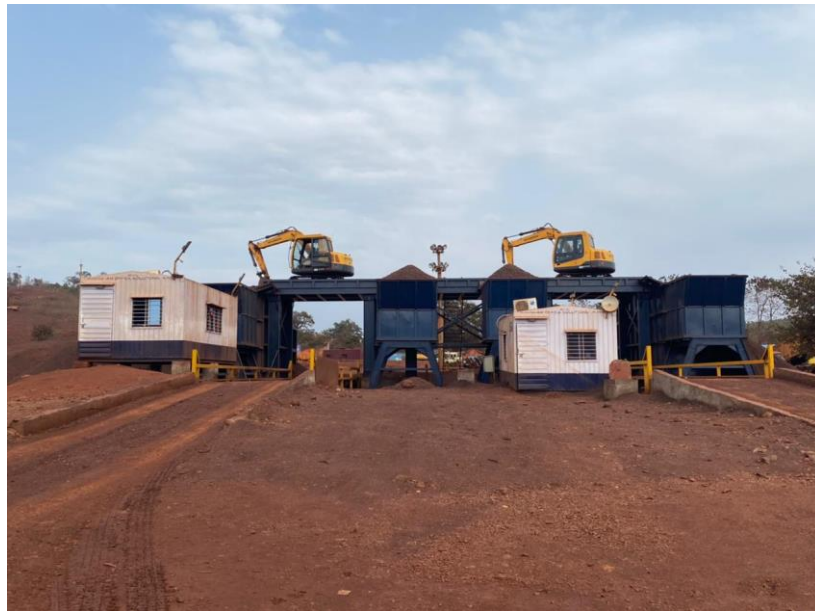
Quick Dispatch System