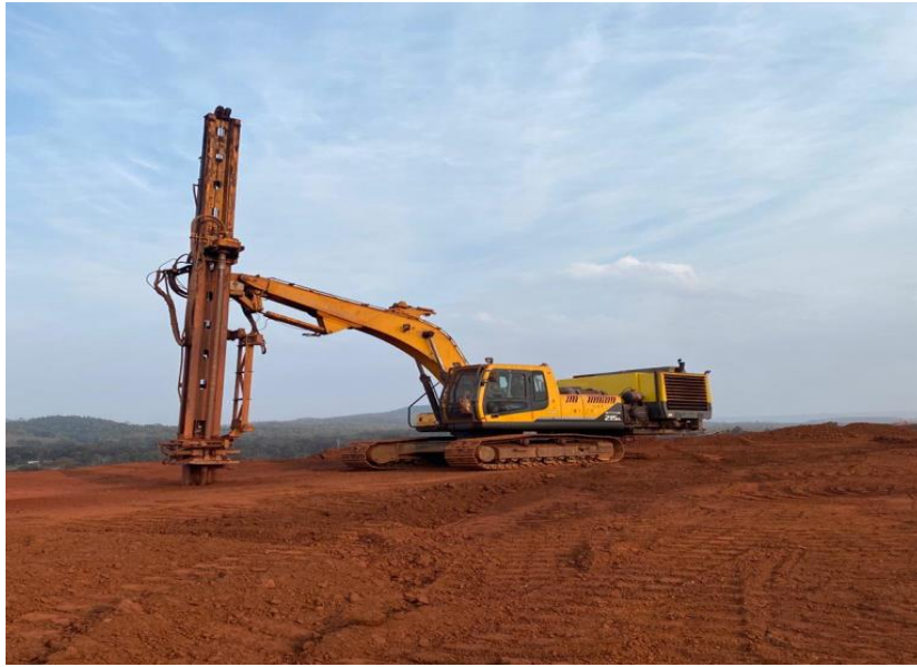
Wet Drilling and Dust Extractor System in Drilling Operation