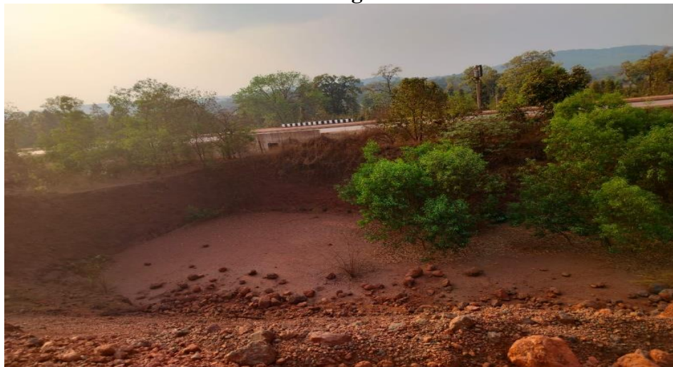
Settling Pond near Quarry 5