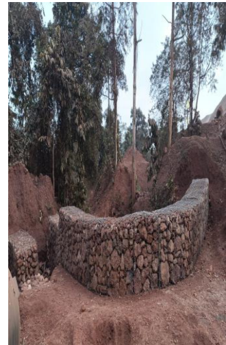
Settling Pond near Dispensary