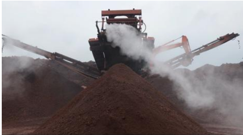
Dry Fog System in Mineral Handling Plants