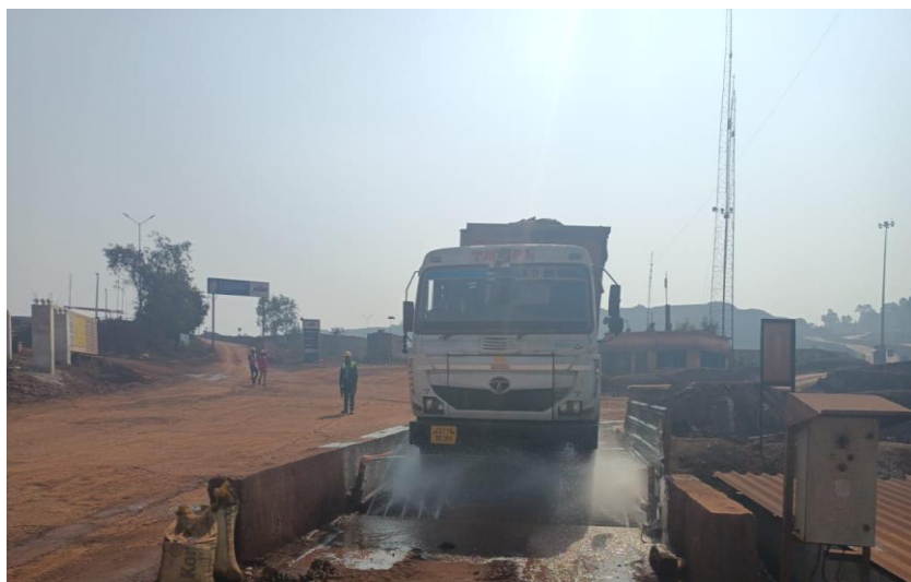
Mechanised wheelwashing System