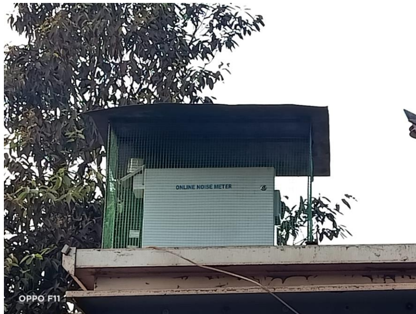
Online Noise Monitoring Device