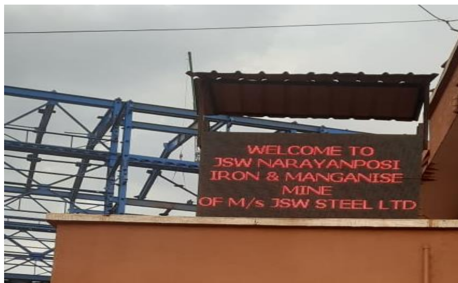
Electronic Digital Display Board at Narayanposhi Mine Gate