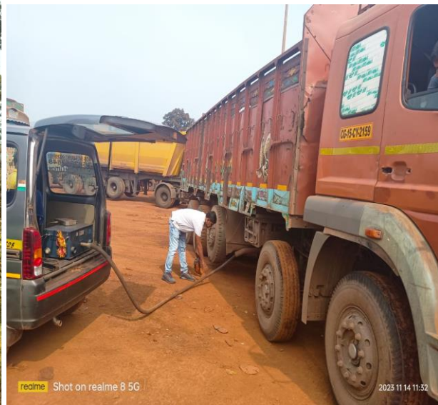
Air Quality Monitoring