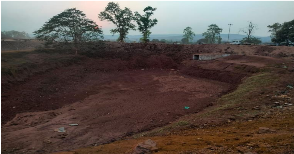
Settling Pond near Gate 2