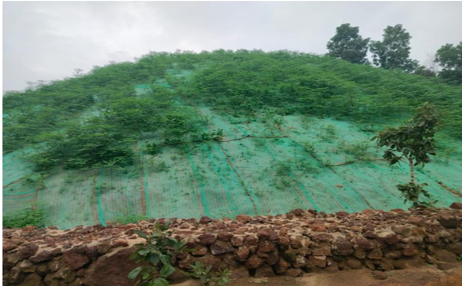
Coir matting on Manganese Dump