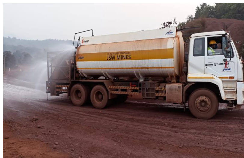
Water Tanker Arrangement for Haul Road Dust Suppression